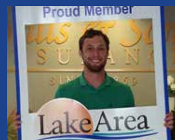
Mills and Sons Insurance