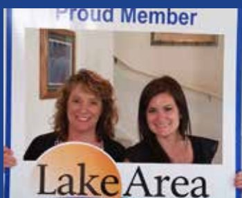
Wilson, Toellner and Associates