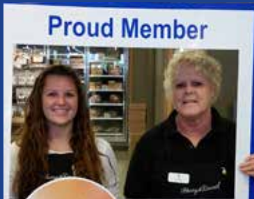
Harry & David