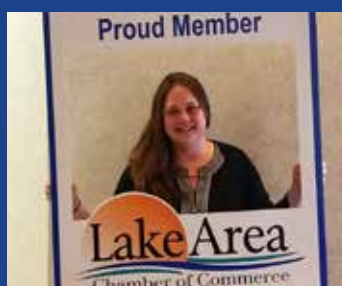
Schultz Surveying & Engineering