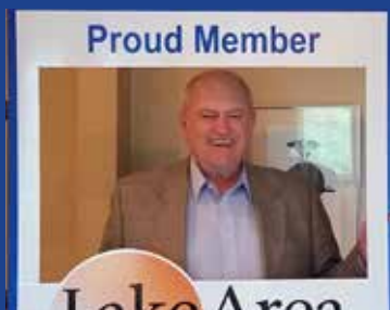
Anderson Creative Marketing & Deisgn