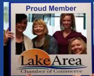
Direct Primary Care Clinics