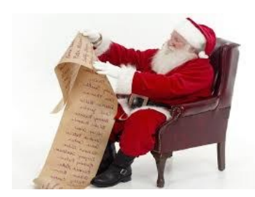
Santa from 5-5:30pm! #1 Willmore Lane, Lake Ozark

Come join the fun on Tuesday, December 17th from 5-7 pm for our Monthly networking social!